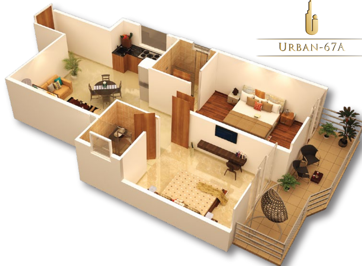
Tentative Layout, 2 BHK- Type B

Carpet Area:- 591 Sq.Ft. + 100 Sq.Ft. Balcony