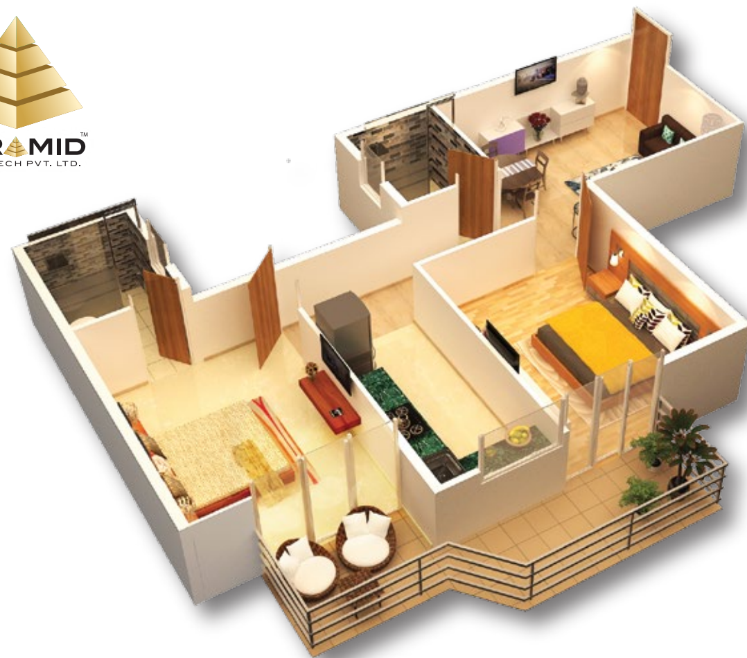
Tentative Layout, 2 BHK- Type A

Carpet Area:- 591 Sq.Ft. + 100 Sq.Ft. Balcony