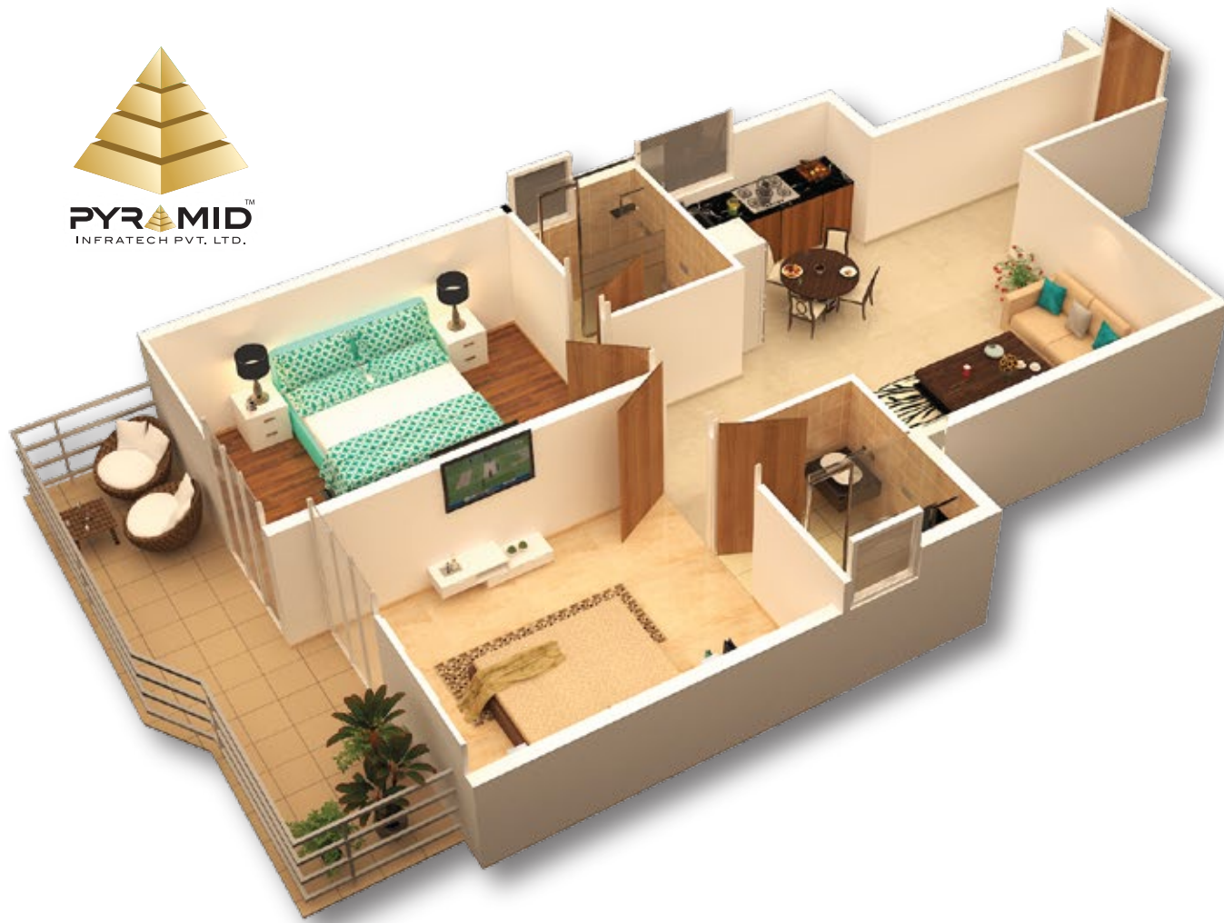
Tentative Layout, 2 BHK- Type C

Carpet Area:- 579 Sq.Ft. + 100 Sq.Ft. Balcony