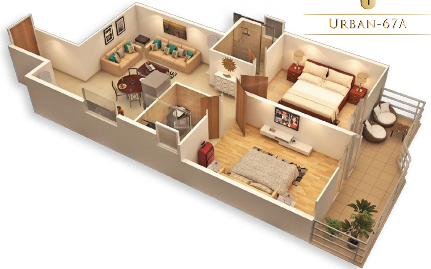
Tentative Layout, 2 BHK- Type D

Carpet Area:- 579 Sq.Ft. + 100 Sq.Ft. Balcony